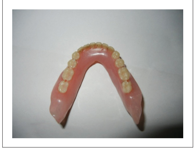
Figure 5 —The screw used to immobilize the denture and the soft liner wafer during night.

Figure 3—Corresponding hole in the mandibular denture