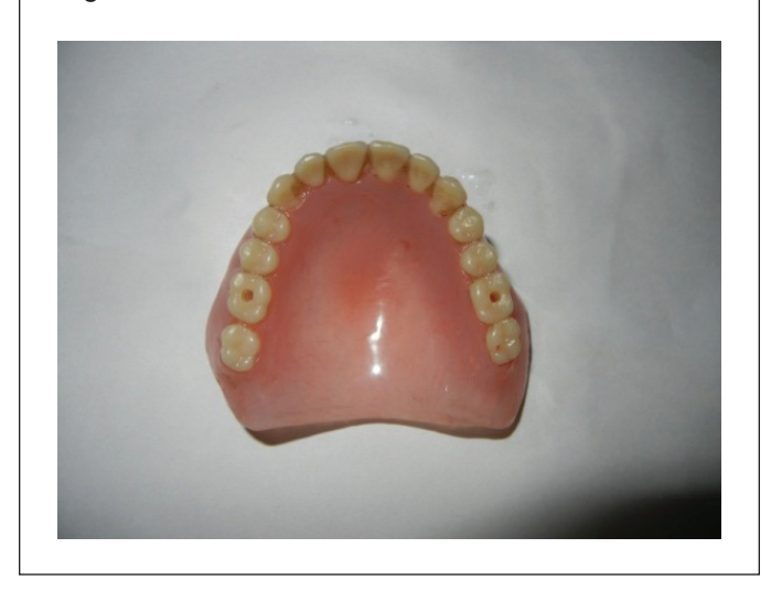
Figure 2—Maxillary denture with hole at 1<sup>st</sup> molar region

Maxillary and mandibular complete dentures were fabricated by the conventional standard procedure. With the maxillary denture in the patient's mouth, facebow records were taken and transferred onto the Hanau "wide vue" articulator. A 3-mm thick wax interocclusal record was made and maximum protrusive jaw movement was done, as dictated by the condylar guidance path. The mandibular denture was mounted on the articulator using the wax record. The wax record was